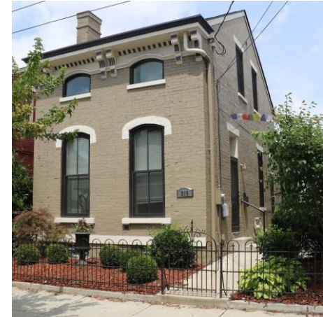
215 W. 10th

Italianate - Most Prominent Architectural Style