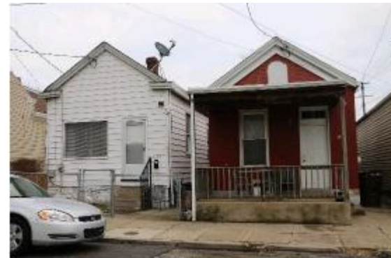
1143 & 1145 Ann