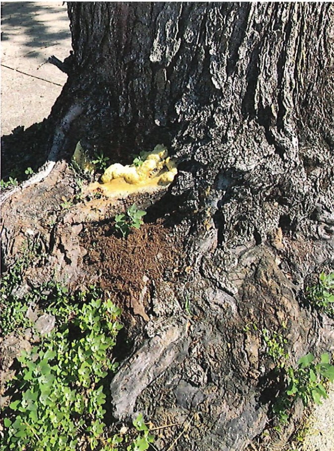
dog slime mold , typically present on decaying plant material